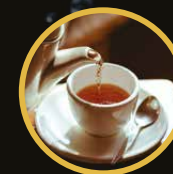
Coffee and Tea

Use great-tasting filtered water for brewing coffee, mixing baby formula, hydrating pets, and more