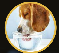
Water for Pets